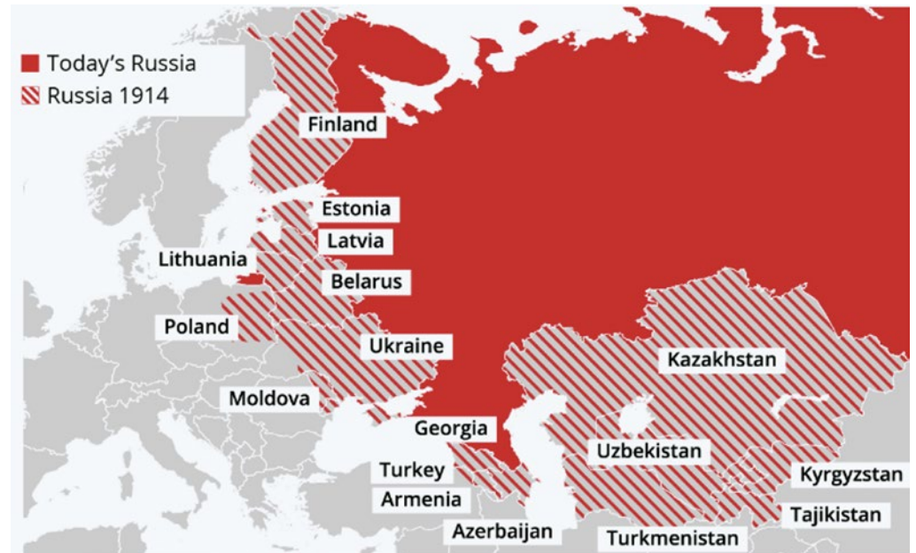
Figure II: Russia's territorial buffers have diminished over the last century

2022 borders.