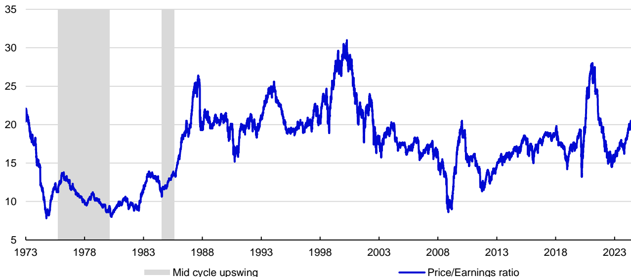
Figure 2 – Global equity price/earnings ratios since 1973

Notes: Data as of 22 November 2024. Past performance is no guarantee of future results. Based on the Datastream Total Market World Index using daily data from 1 January 1973.