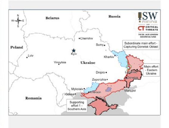
US credibility damaged; Russia gains land bridge to Crimea, more Ukrainian territory. World is at risk of greater fragmentation?

somewhat multipolar world, and yet not so an fragmented?