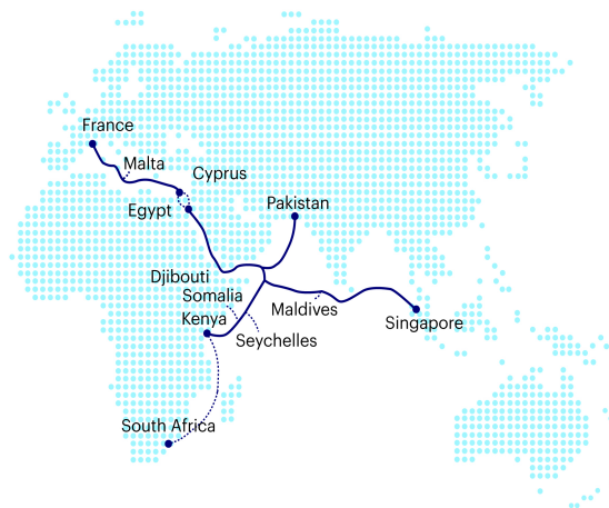
Figure 1 – Pakistan and East Africa Connecting Europe (PEACE) cable

Connecting the Internet across Belt and Road countries using fiber-optic cables is a major component of the DSR. As of 2019, China was a landing point, owner, or supplier for 11.4% of the world's undersea cables. This proportion is expected to grow to 20% between 2025 and 2030. 2 The Pakistan and East Africa Connecting Europe (PEACE) project is an ambitious element of this plan where a 15,000 km long subsea cable network is being built to service countries across the BRI region with the aim to link Asia, Africa, and Europe (Figure 1).